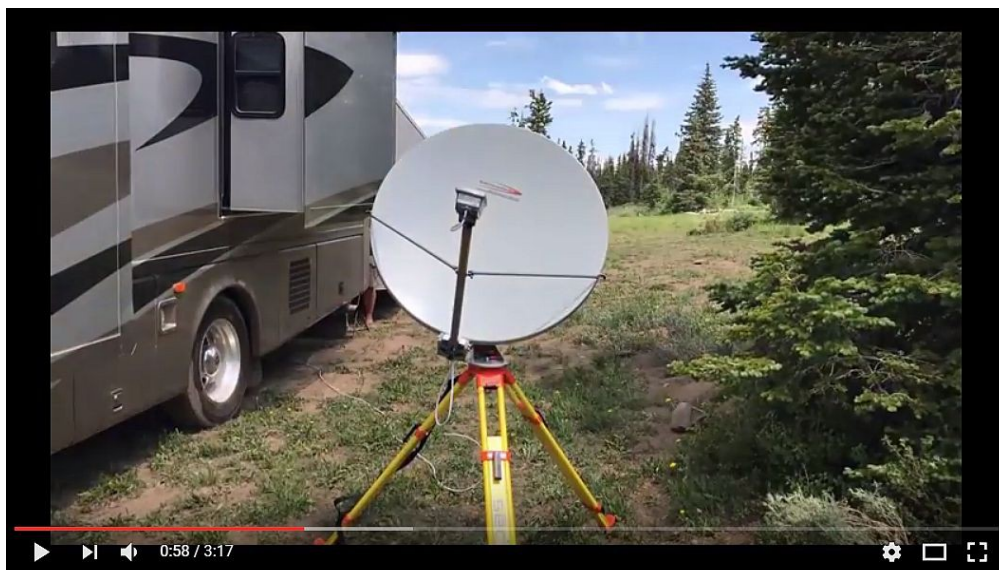
HughesNet Gen 5 Mobile Satellite Deployment

Why a satellite terminal? Satellite may provide the only reliable connection after an earthquake. Broadband internet will be invaluable (for things like drone photography), and the HughesNet Jupiter2 service is more than half the cost of cellular data plans.